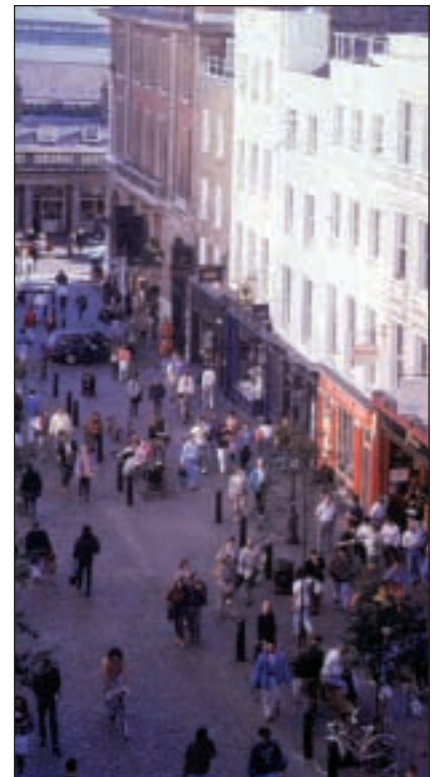
Vibrant area with uses mixed vertically

An overall mix of 40% commercial and 60% residential will be promoted. The residential category of land use is predominantly related to dwellings. However, community and youth facilities and local shopping will be encouraged and cultural and hotel uses will be open for consideration. The framework enables a range of unit sizes to be developed which can accommodate various scales and types of use, from corporate to 'own front door' offices and from apartments to family housing. The uses should be mixed either within streets or buildings, i.e. vertically or horizontally. Single storey uses, such as retail, restaurants and public houses should have residential or office accommodation above.