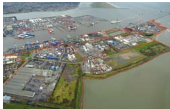
Aerial View with projected Planning Scheme Boundary

1.3 The Planning Scheme will provide the framework to deliver long-term social, economic, planning and environmental benefits for Dublin. It will include environmental, landscape and public realm improvements and accessible and attractive public open spaces. Public transport provision and improvements to the strategic road network will support the development, together with appropriate services, utilities and infrastructure. All parts of the development will be subject to sustainability assessment against a Sustainability Toolkit (see section 10.0). The Planning Scheme is supported by an Environmental Impact Assessment.