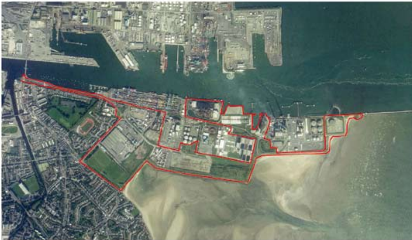
FIGURE 1.2: BOUNDARY OF THE POOLBEG PLANNING SCHEME