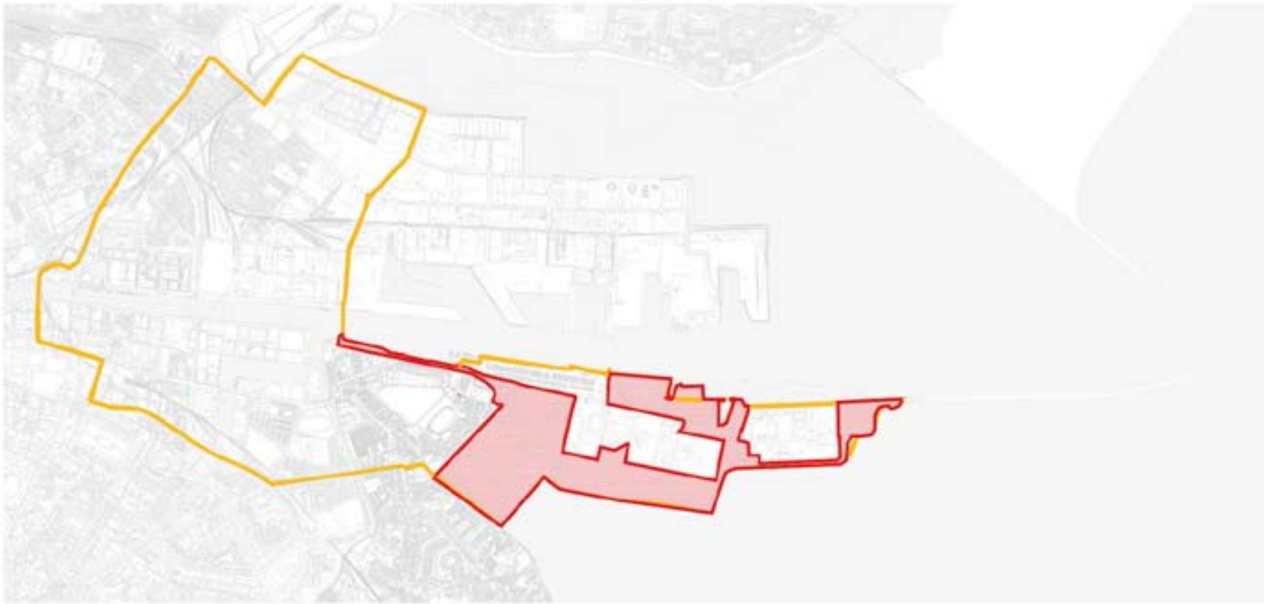
FIGURE 1.1: BOUNDARY OF THE DDDA MASTER PLAN AREA AND THE BOUNDARY OF THE POOLBEG PLANNING SCHEME