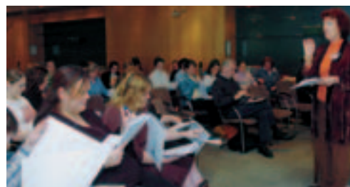
Circletime Introductory group November 04