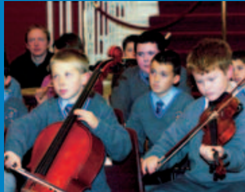
"Star of the Sea" Boys

The Music in the Docklands Programme is continuing this year with Larkin Community College and St Joseph's National School, East Wall currently participating. The two schools will come together to perform their masterpiece at the National Concert Hall on Friday 11th March.