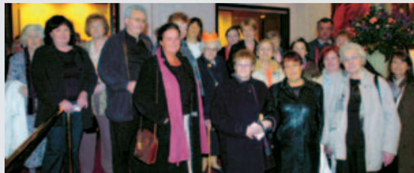
Seniors at the Concert Hall Dec 04