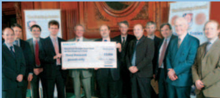
The Sir John Rogerson’s Quay team pictured at the awards ceremony

Last year’s joint winners were the New York Twin Tower Recovery Effort and Dublin Port Tunnel.