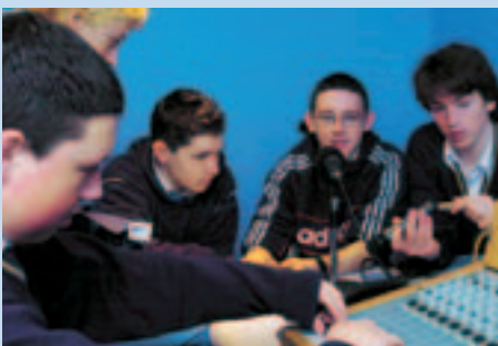
Marian College students

Tune in to 103.2FM Mondays and Fridays at 1pm from now until the end of May to catch the voices of young Docklanders.